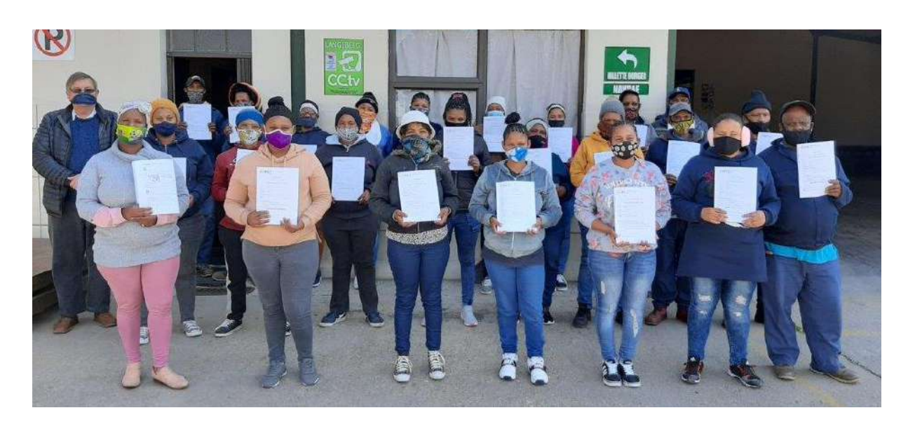
Kotze & Baard group