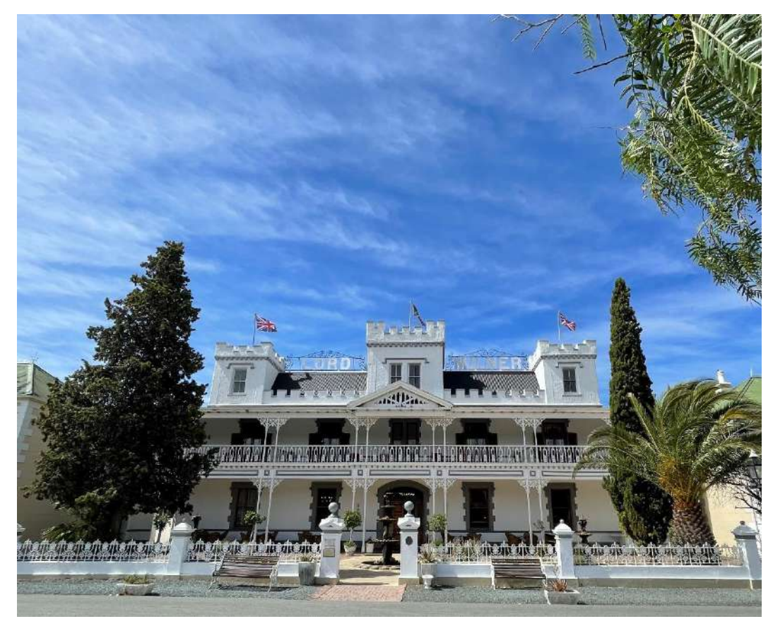
The Lord Milner Hotel in Matjiesfontein