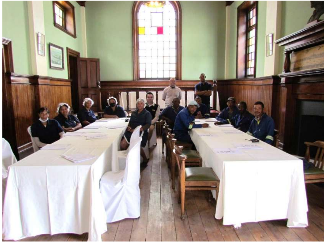
The Matjiesfontein group