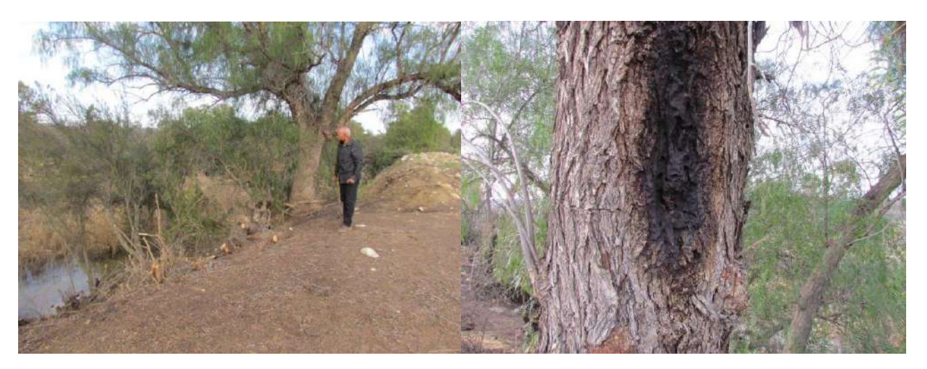
Working around a tree with bees, protecting the bees