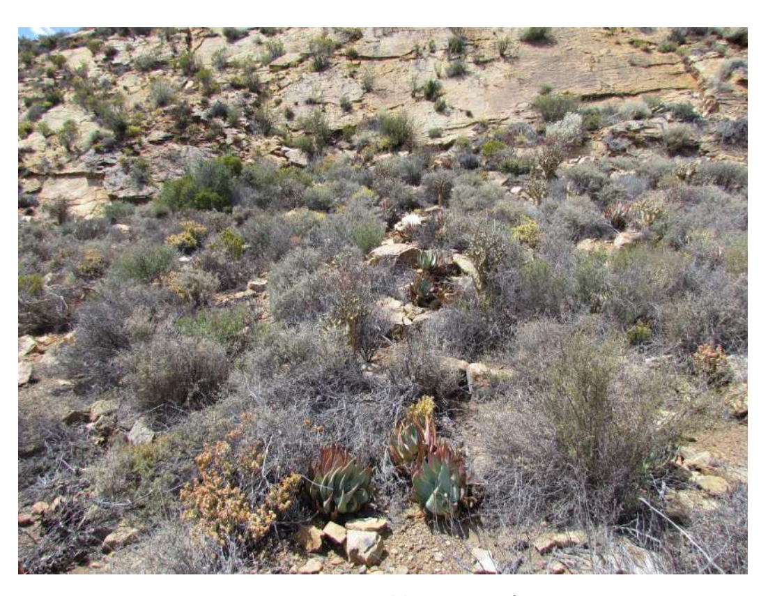
"Rantjiesveld" in Matjiesfontein

• The attendance registers for the training and meeting are attached as Annexure F.