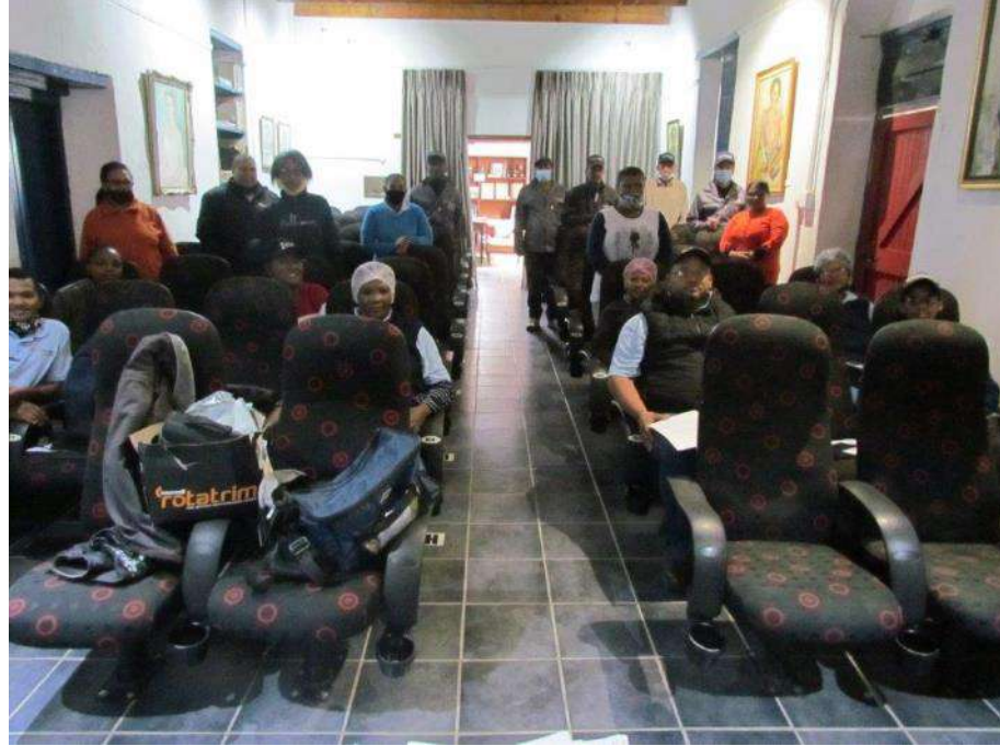
The CDFP group being trained in the Montagu Agriculture Museum