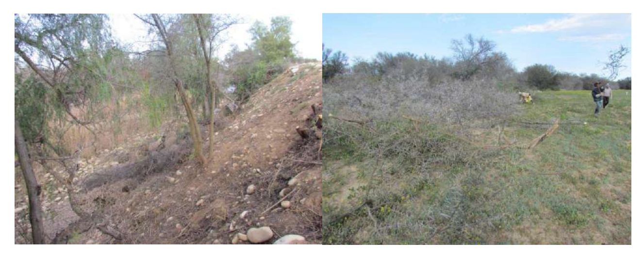
Selective removal to protect the riverbank