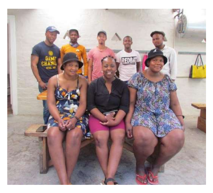
One of the Business and Processing groups at Bergendal