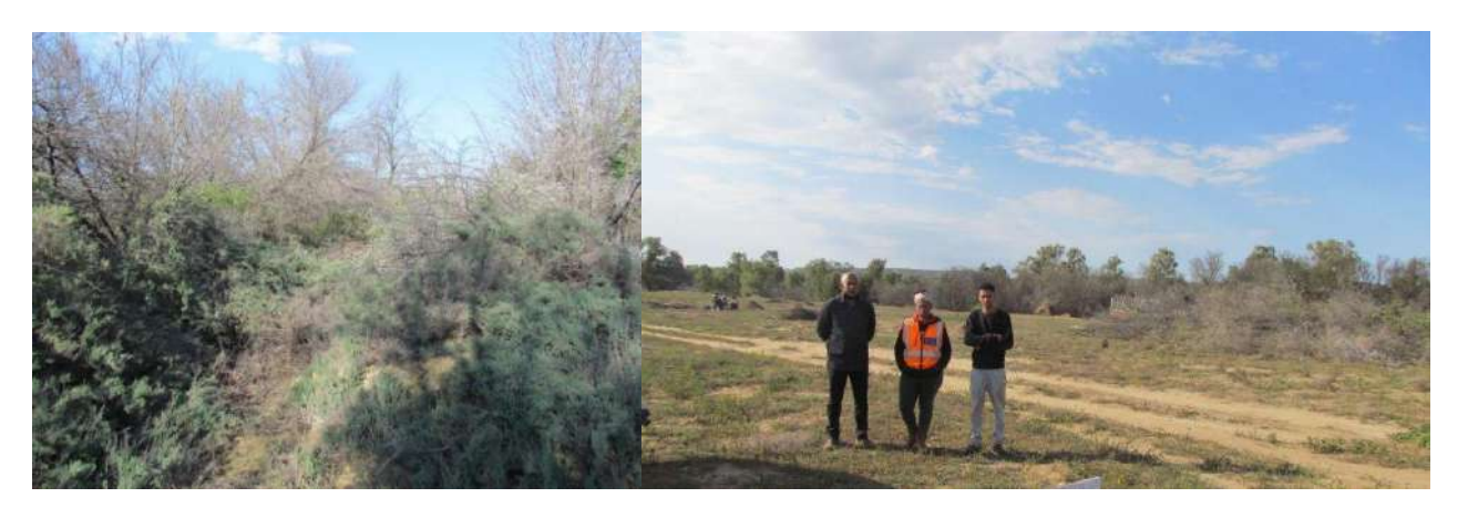
Sckardef bush Sckardef leaders